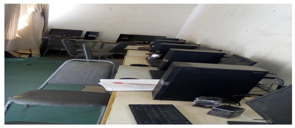
Internet room for students with special need at Wollo University

This kind of service were not common to all sampled universities. In the same vine, one university had assistive computer technology with JAWs software for students with visual impairment in one branch of the library (Wollo University). In addition, the department of special needs education set up resource center which has assistive computer technology with the above software (Gondar University). This resource center has been providing training and internet service for all students with disabilities found in the university. Two universities also established disability service center for the purpose of assisting students with disabilities found in all departments (Wollo and Debre Tabor University.)