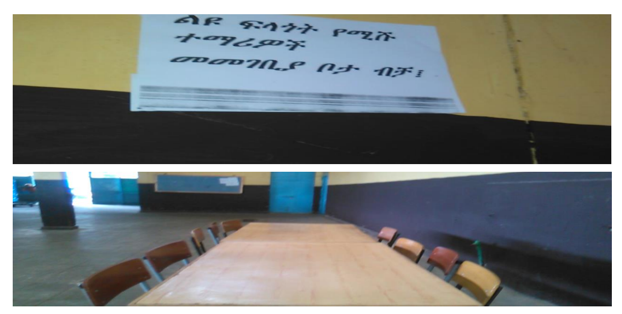
Feeding room for students with disabilities